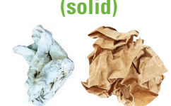
Tissue and paper towel