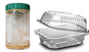
Plastic containers (empty)