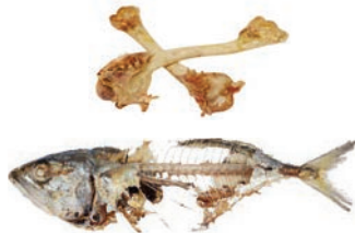
Meat, fish and bones