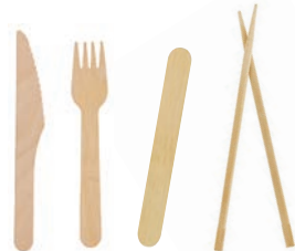
Wooden cutlery, stir sticks and chopsticks