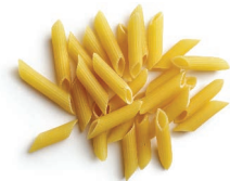
Pasta and grains