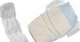
Diapers and feminine hygiene products