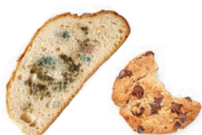
Baked goods and desserts