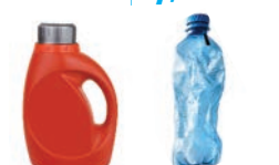
Plastic tubs, lids, jugs, bottles and jars