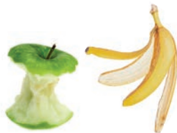
Fruits and vegetables