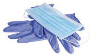
Gloves and masks