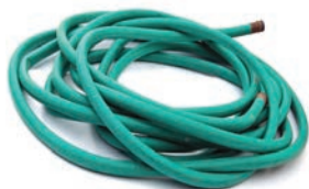
Rope, cable and hoses