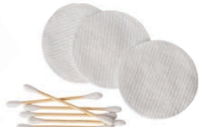
Cotton swabs, pads and balls