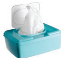
Wipes, mops, dryer sheets and lint