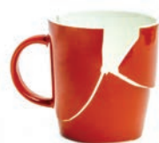
Dishes and drinking glasses