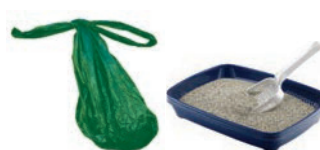
Pet waste, bedding and cat litter