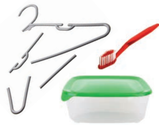
Non-recyclable plastic items