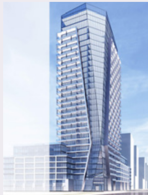
Status: Zoning Approval