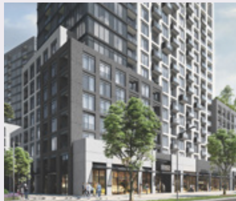
Status: Built & Occupied (2022)