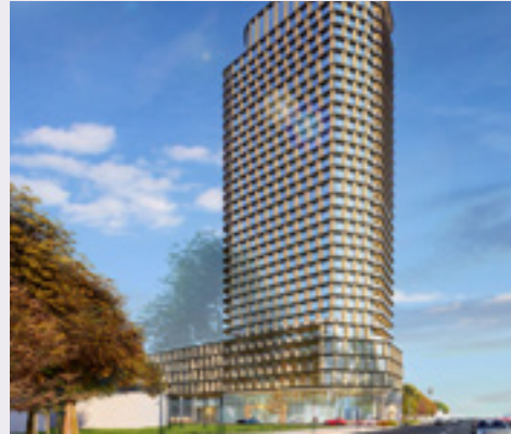
Status: Zoning Approval