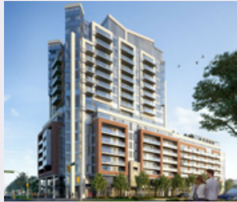
Status: Under Construction