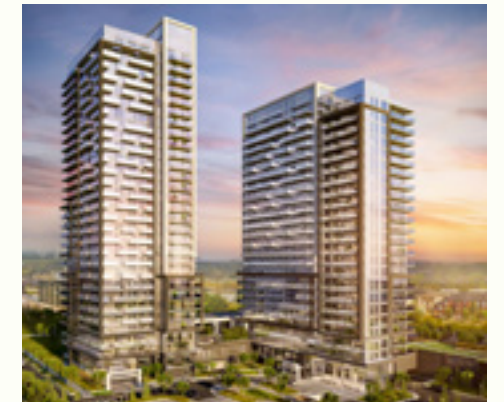
Status: Built & Occupied (2024)