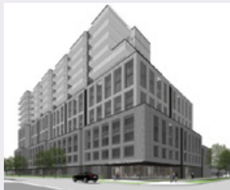
Status: Application Submitted