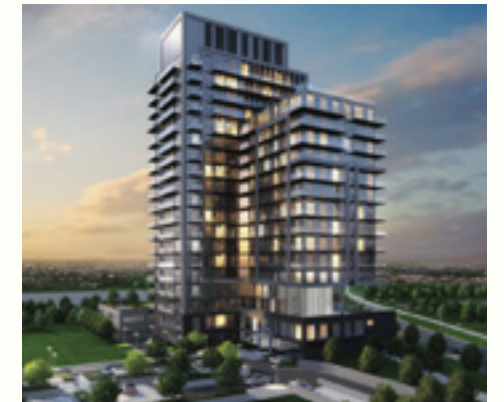
Status: Built & Occupied (2022)