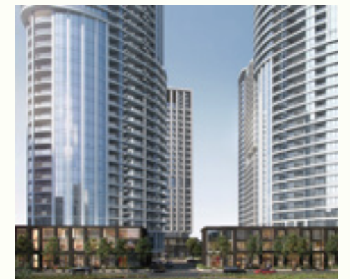
Status: Zoning Approval